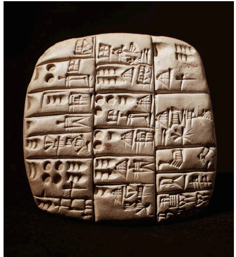
Cuneiform writing was produced by pressing reeds into wet, unhardened clay

As people learned to farm, they changed their clothing from wild-animal skins to what they could make from their domesticated animals and plants. In Mesopotamia this meant that most people wore woolen garments made from the fleece of their sheep, even in hot weather. Only the elite could wear linen, a textile made from the fibers of flax plants, because the process of making it took much longer than weaving or knitting wool.