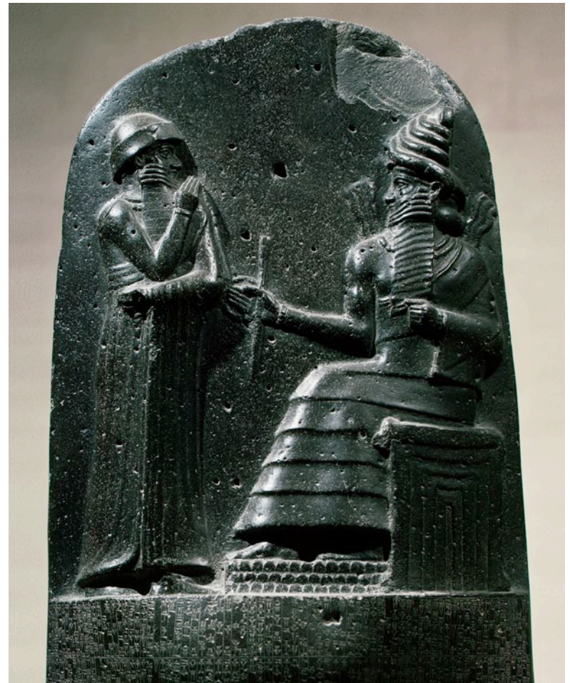
Hammurabi receives the laws from the Mesopotamian deity Shamash

Traditions from southern Mesopotamia also were adopted by Greek scholars, who got them from Babylonia. Especially in mathematics, ideas from Mesopotamia persist. Our day is still divided into 24 hours, each hour into 60 minutes, and each minute into 60 seconds. A circle still consists of 360 degrees. Cuneiform writing was used regionally until the beginning of the Common Era, when it disappeared; about 300 current scholars have learned