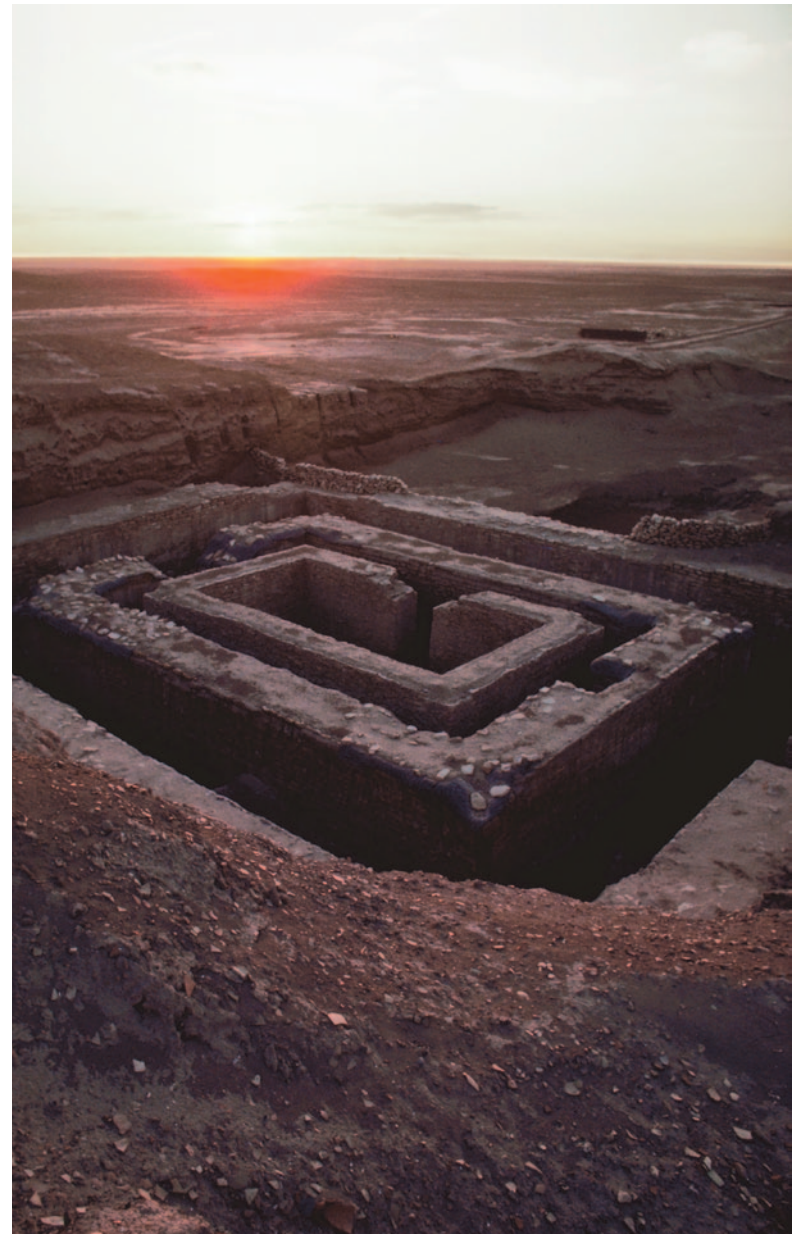
The ruins of Uruk

By roughly 4000 BCE people living in higher places in what is now Iraq had settled down to care for domestic sheep and goats and to grow wheat, barley, and peas. Yet their climate was changing; less rain was falling, and they needed to move to more stable sources of water.